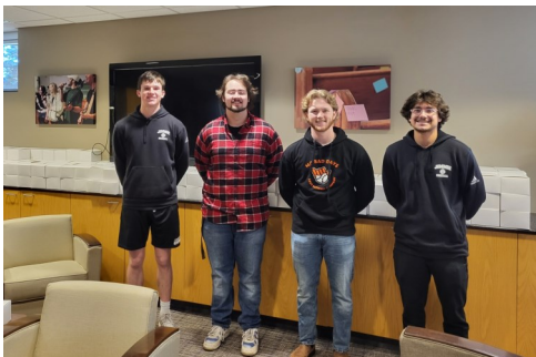
UJ Student Receiving Crew!