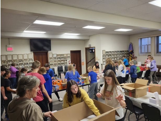
Care Package Assembly!

In October and November members of Jamestown churches brought leftover Halloween Candy and other treats to church offices. Then on Wednesday, November 15th, the 6th and 7th grade Confirmation Class took all those donations and assembled 300 Finals Week Care Packages for students at the University of Jamestown (in less than 30 minutes!). On Tuesday, November 28th those packages were delivered. Students from UJ gratefully helped unload the boxes. Now, during finals week, UJ students will be encouraged by your generosity. Please hold all college students in your prayers as they end this semester's work and head home for winter break.