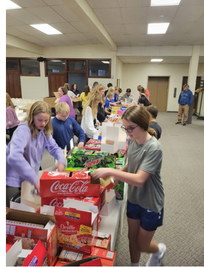
Care Package Assembly!