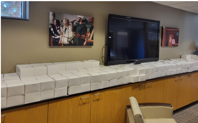
Care Packages awaiting pick-up by UJ Students!