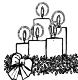
The Light of the World

Find information about the Christians in Action Advent thru Christmas Devotional on page 4!